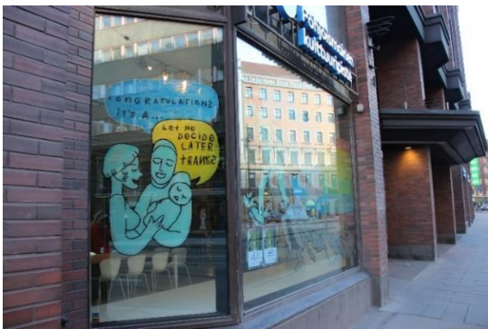
The displays windows, painted by safe house artist Shieko Reto, January 2017